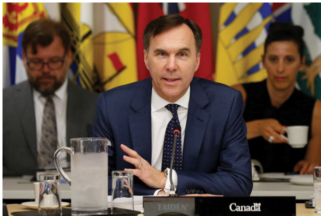
Federal Finance Minister Bill Morneau is proposing changes to "level the playing field" by changing income tax rules that allow some to avoid tax through "fancy accounting schemes."

On July 18, 2017, the Canadian federal Finance Minister, Bill Morneau, announced the release of a consultation paper and draft legislation which, if enacted, will have a dramatic impact on the taxation of Canadian private corporations and business structures that Canadian entrepreneurs have had in place for decades. An announcement was expected, as the federal government had indicated in its 2017 Budget that proposals would be put forward to address perceived inequities in the Canadian corporate tax system. However, the scope of the proposals went beyond the expectations of most tax professionals and will affect most Canadian business owners who carry on business through a private corporation.