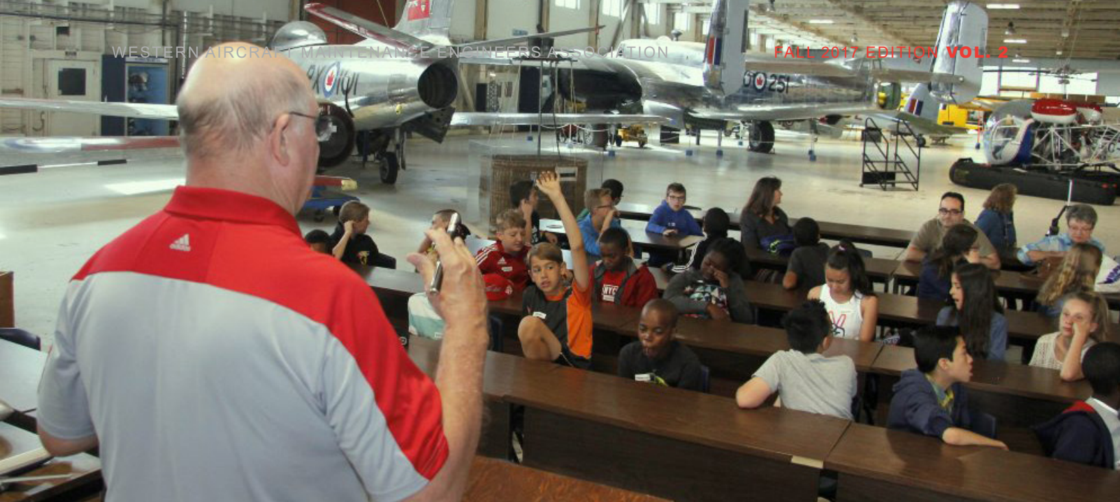
Alberta Grade 6 students at an exceptional Theory of Flight program offered at Alberta Aviation Museum www.albertaaviationmuseum.com/school-program/